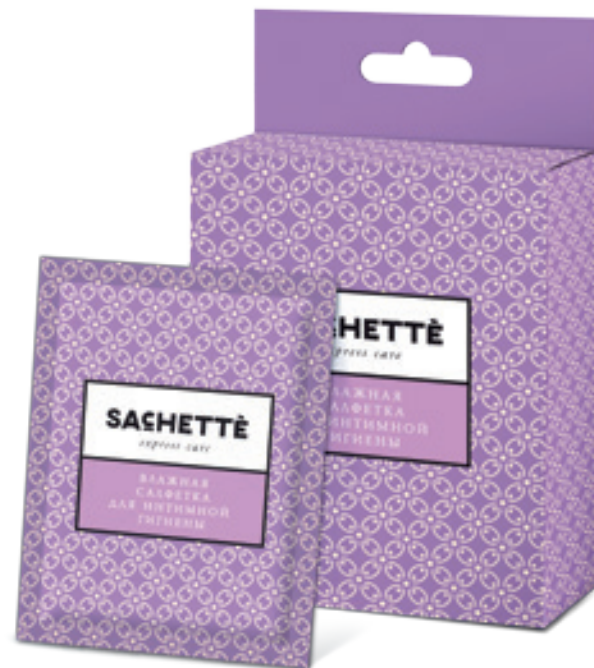
PRODUCT RANGE OF «EXPRESS CARE» COLLECTION: