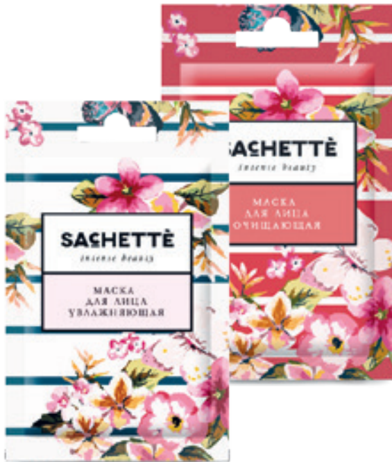
PRODUCT RANGE OF «INTENSE BEAUTY» COLLECTION: