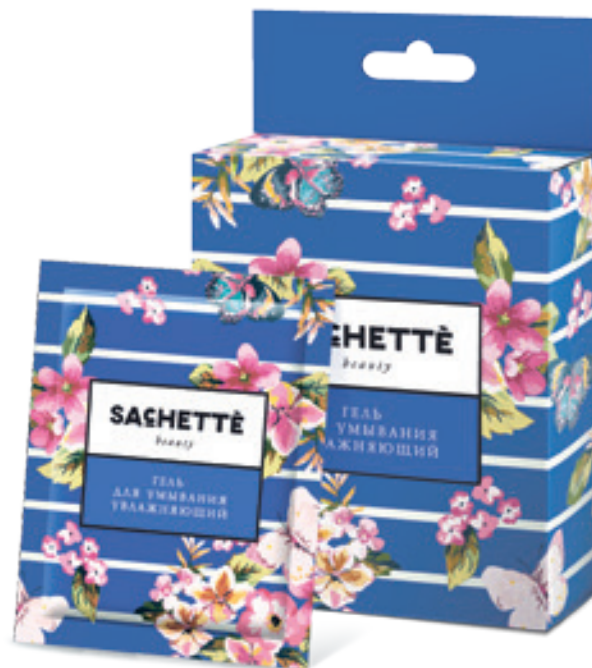
PRODUCT RANGE OF «BEAUTY» COLLECTION: