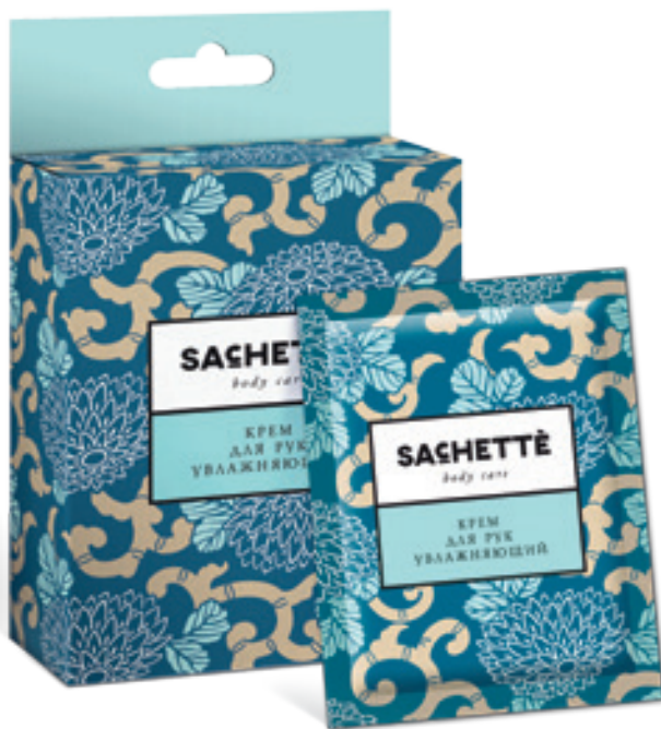
PRODUCT RANGE OF «BODY CARE» COLLECTION:

Cardboard box – 5 sachets of 3, 7 and 10 ml