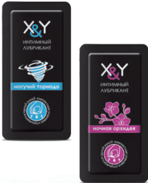
RANGE OF LUBRICANTS' AROMAS: