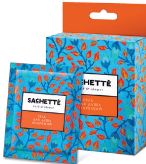
PRODUCT RANGE OF «BATH AND SHOWER» COLLECTION FOR BODY: