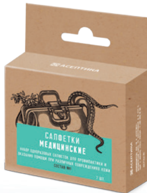
COMPOSITION OF WIPE WITH MEDICATIONS: