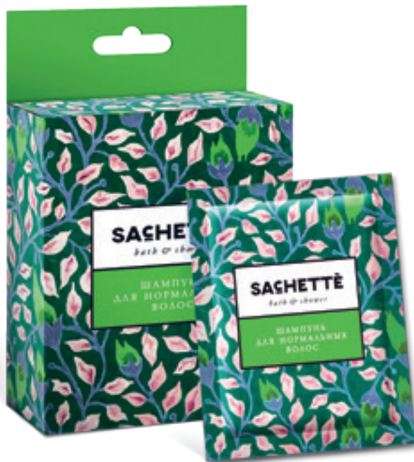
PRODUCT RANGE OF «BATH AND SHOWER» COLLECTION FOR HAIR: