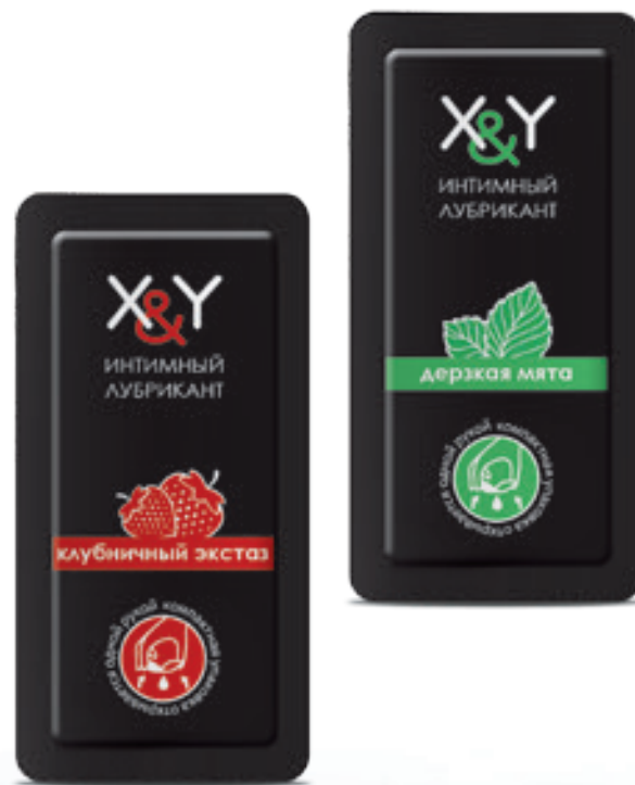
RANGE OF LUBRICANTS' AROMAS: